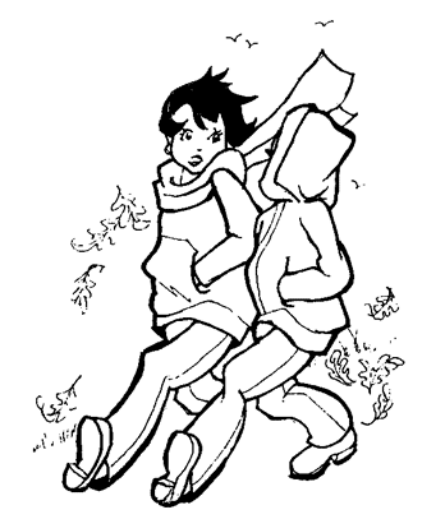
"I don't want to trudge the Road of Happy Destiny -I want to sprint it."

Night Owl Tidbit: Do you have an interesting Night Owl story you want to share? Send an e-mail to <a href="mailto:nightowl@aastpaul.org">nightowl@aastpaul.org</a>.