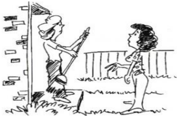
"I'd like to make amends for stealing your husband. I'm sober now. Will you take him back?" - (The Grapevine, Dec. 2012, Reprinted with permission of the A.A. Grapevine, Inc.)