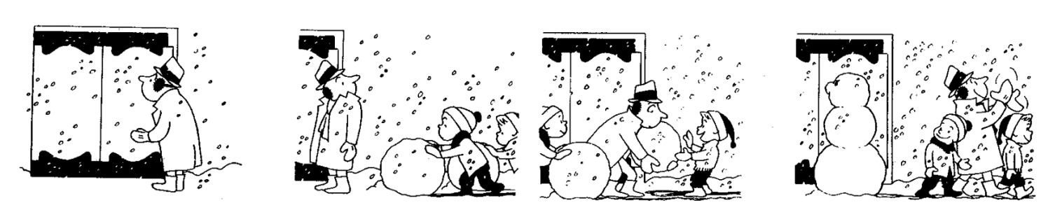
Victor E. cartoon

We invite you to share your AA news here! Please send your items to lifeline@aastpaul.org . We look forward to hearing from you.