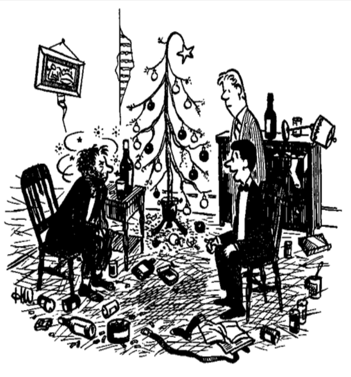
"... and you didn't see how one little glass of eggnog could hurt?"

"The Language of the Heart Will be Spoken Here" Anchorage, Alaska February 10 - 14, 2011 http://www.internationalwomensconference.org/