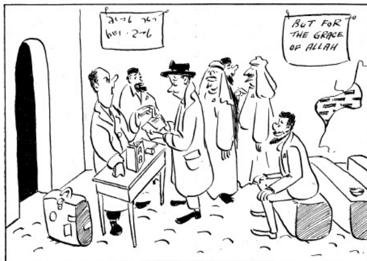
“See I told you—we’re supposed to speak at Bethlehem Pennsylvania!”